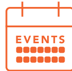
Year Round Events